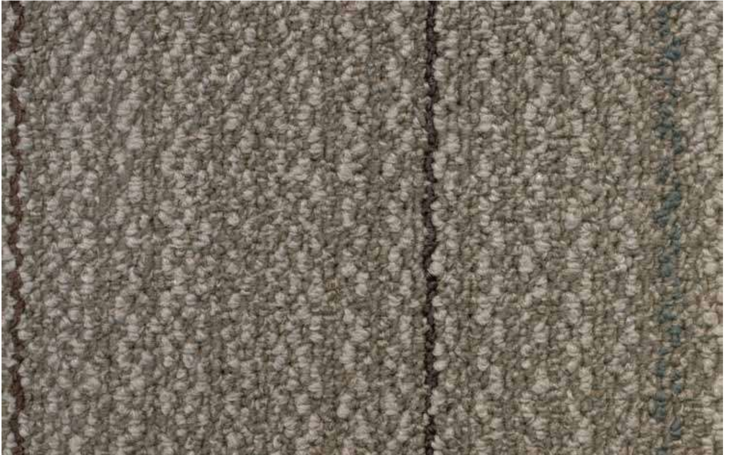
Cookies n Cream (14107)