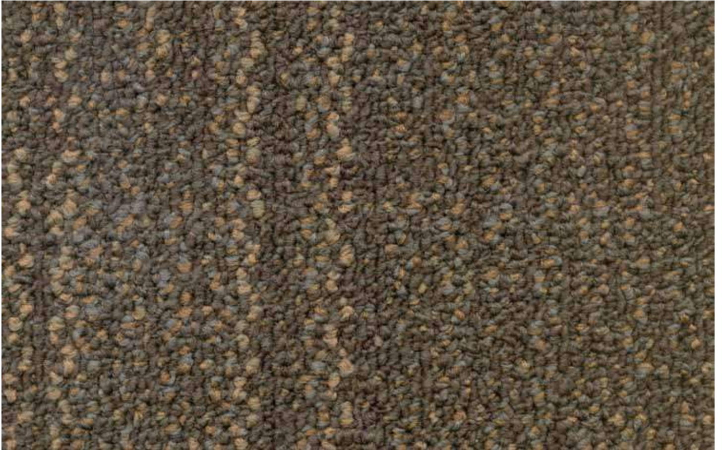
Chai Latte (83098)