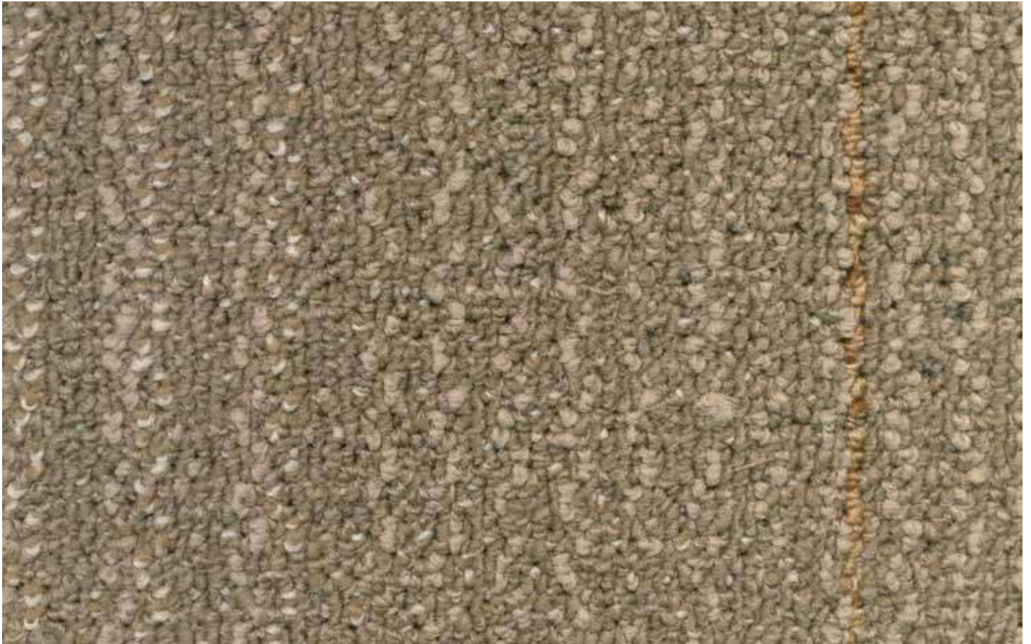
Tapioca Pudding (42102)